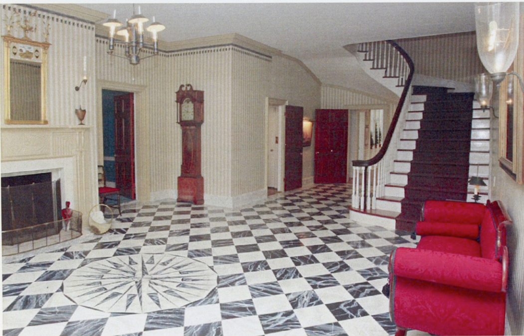
Gracie Mansion's historic foyer