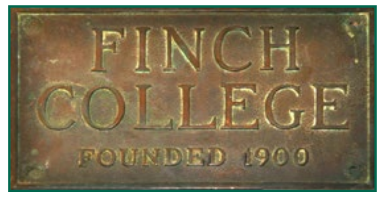
Original Bronze Plaque From the Front Door of Finch College. Inscription: "Finch College, Founded 1900"